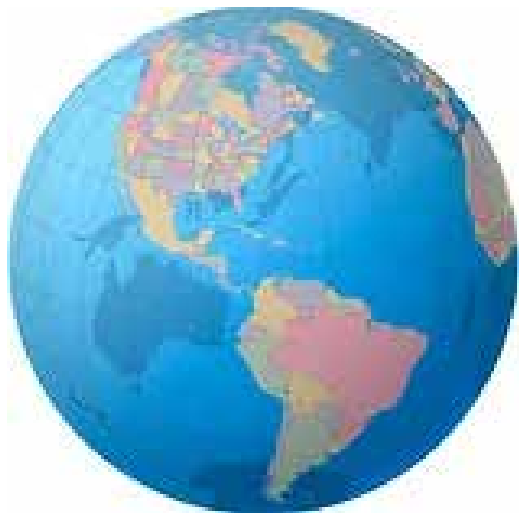
MARPRO Associates Intl