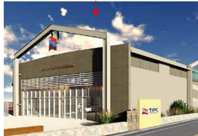
Adventure cruise terminal building